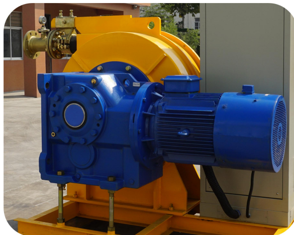
Helical bevel gear units for reducer