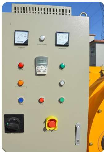
Nice quality electric control box